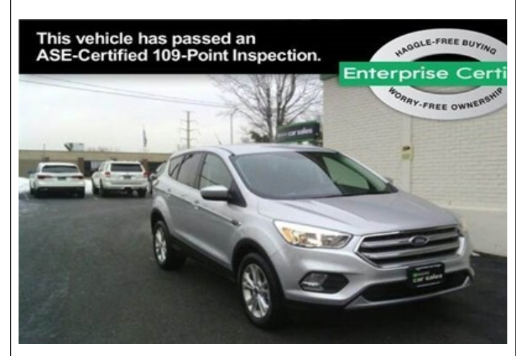
CONTACT BRENDA AT EXT. 23 FOR MORE INFORMATION ON OWNING THIS BEAUTIFUL CAR!

2017 Ford Escape SE Sport Utility 4D www.enterprisecarsales.com for further info